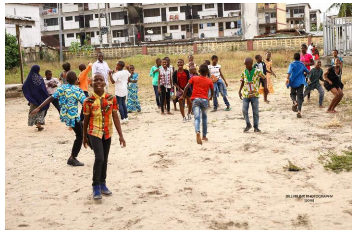
Everyone enjoying the different games