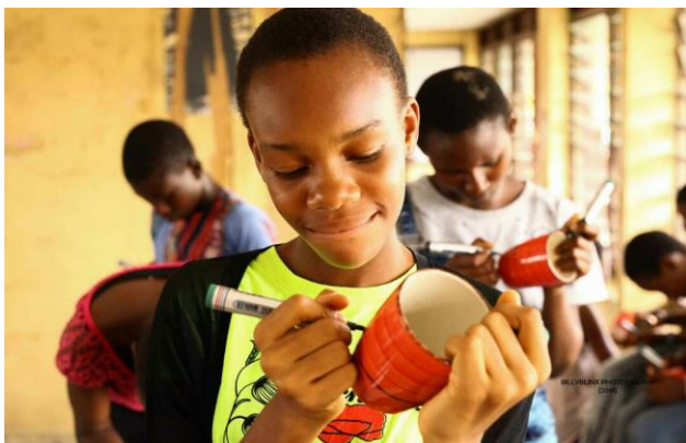
Designing mugs for mother and child

Afterwards, the kids designed mugs with positive messages to be delivered to mothers at the Mother and Child Care Hospital at First Gate, Festac Town. Some of these designs include: “You are the best! Welcome Baby! Beautiful Baby!”, etc. The purpose was to reiterate the importance of caring for others and teach them positive affirmations not only for themselves but for others.