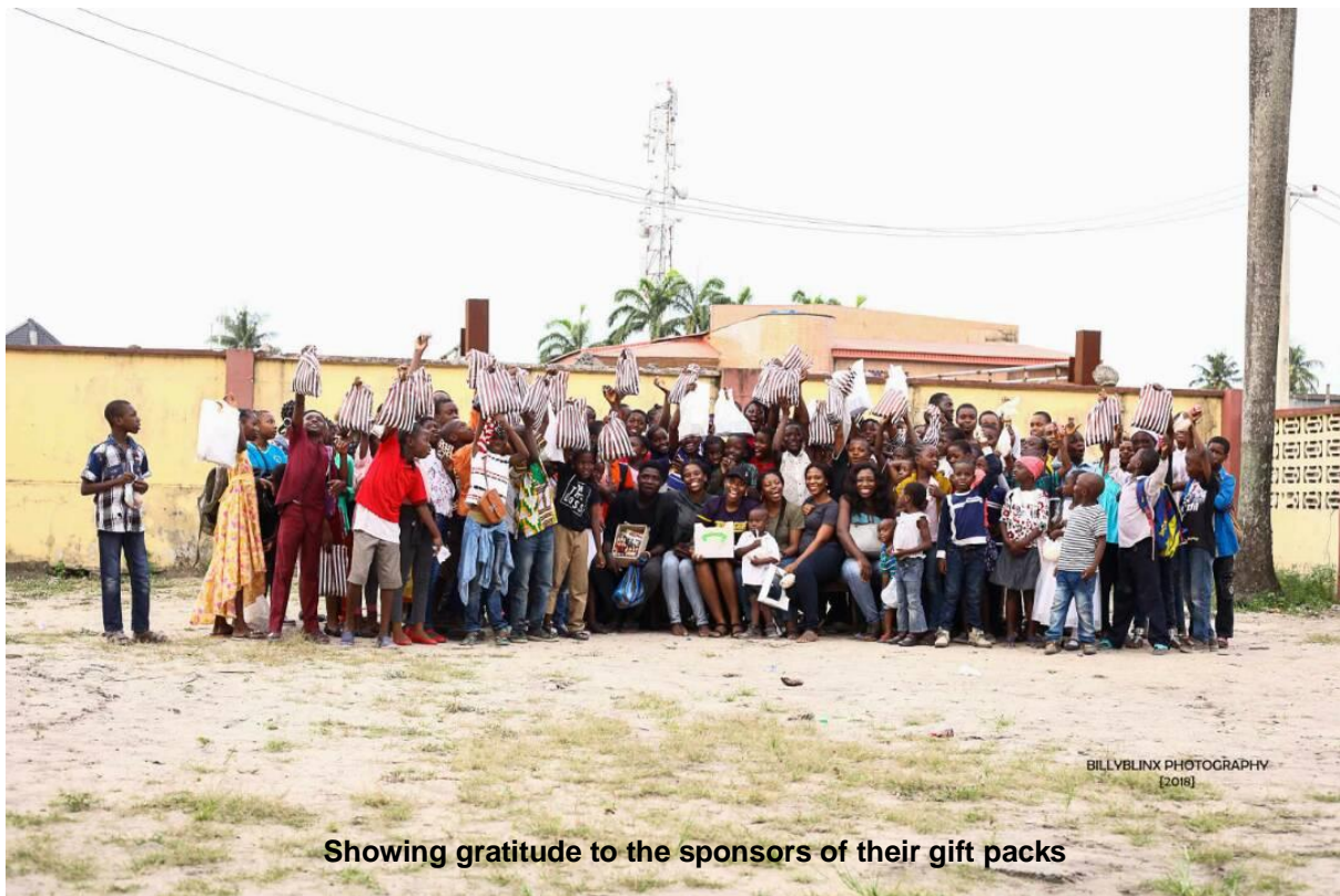
Showing gratitude to the sponsors of their gift packs