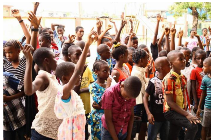
Kids participating in quizzes and competition

The movie “The Croods” was chosen for the kids to watch and it was an exciting time as all eyes were glued to screen with intermittent outburst of laughter while mouths and hands moved in sync to the popcorn made available.