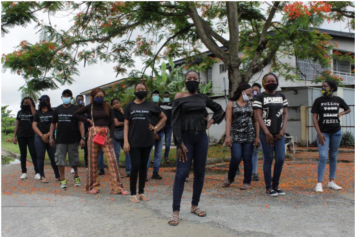
The PYP Family representing our sponsors