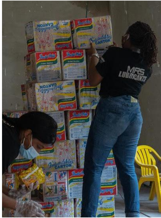
Beginning distribution again